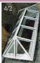
Hip ended (typical)