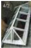
Hip ended (typical)